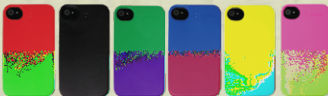
BIO-IP4-10 BIO-IP4-01 BIO-IP4-28 BIO-IP4-03 BIO-IP4-16 BIO-IP4-12