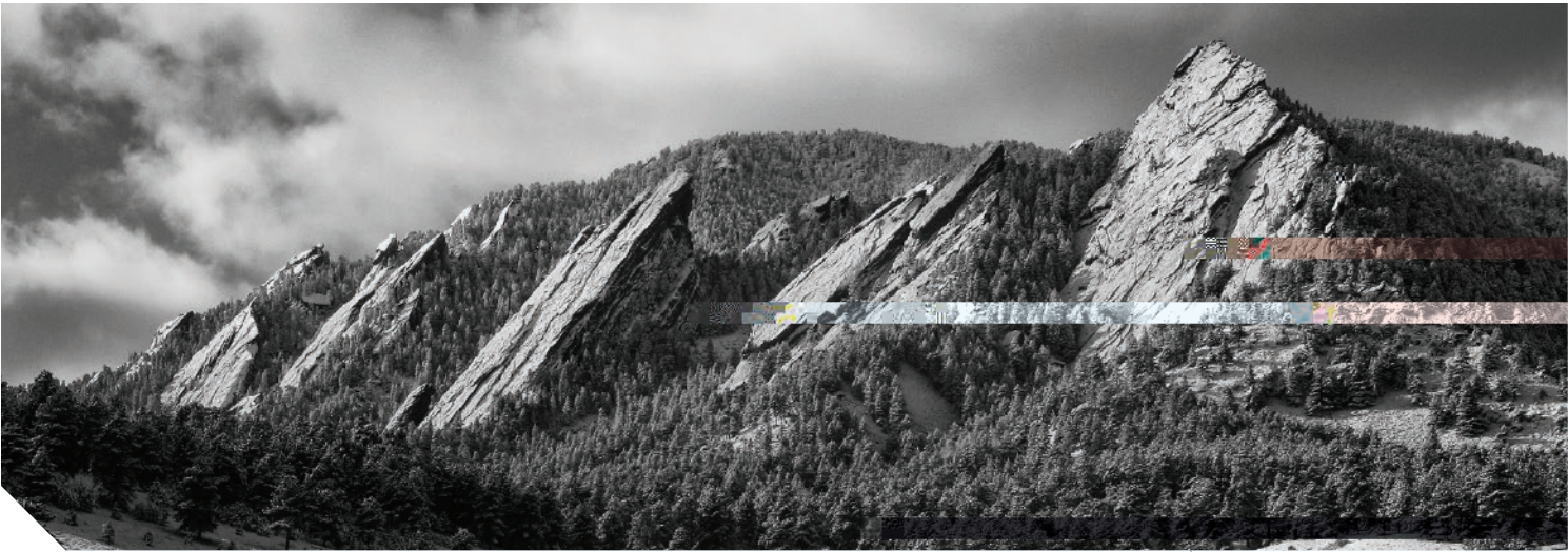
LOCATED IN BOULDER, COLORADO, USA