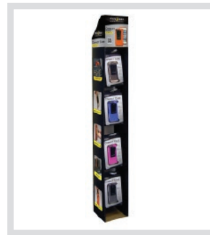
SIDE KICK DISPLAYS