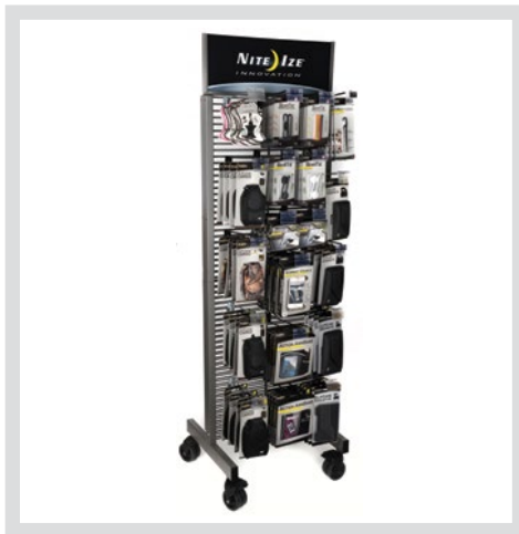
PERMANENT FLOOR DISPLAYS