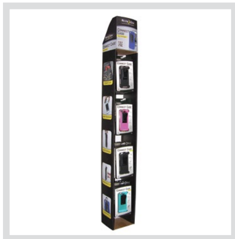
SIDE KICK DISPLAYS