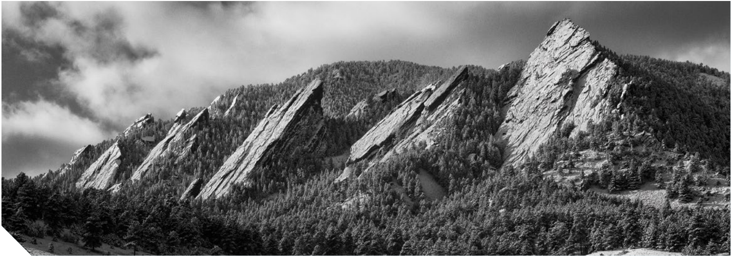
LOCATED IN BOULDER, COLORADO, USA